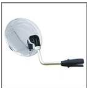
Ref. 1106 Ø 100mm