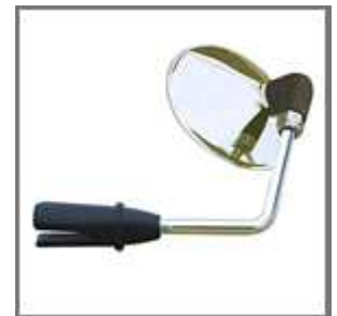
Ref. 1108 Ø 80mm