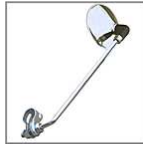
Ref. 1114 Ø 80mm