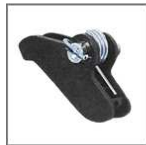
Ref. 0074 Suzuki L