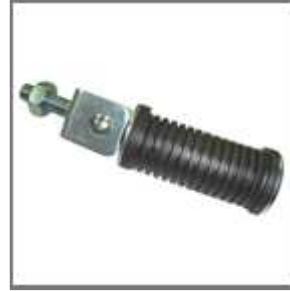
Ref. 0353 M10 Suzuki