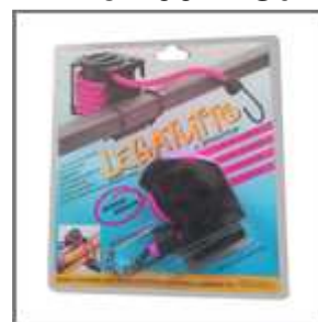
Ref. 1330 Pulpo