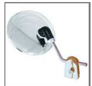
Ref. 0110 Ø 100mm