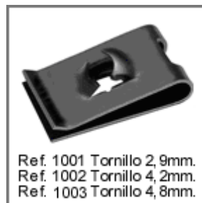
Ref. 1001 Tornillo 2,9mm. Ref. 1002 Tornillo 4,2mm. Ref. 1003 Tornillo 4,8mm.