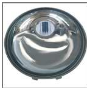
Ref. 0082 Faro Iso