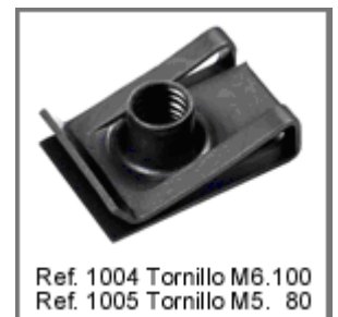
Ref. 1004 Tornillo M6.100 Ref. 1005 Tornillo M5. 80