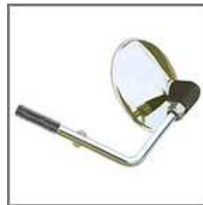
Ref. 0105 Ø 80mm