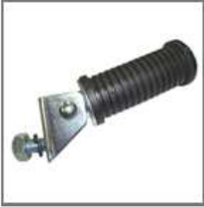
Ref. 0138 Montesa