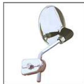
Ref. 0112 Ø 80mm