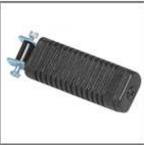
Ref. 0342 Recambio