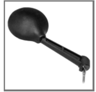
Ref. 1302 Derbi