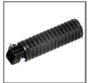
Ref. 0347 Rieju