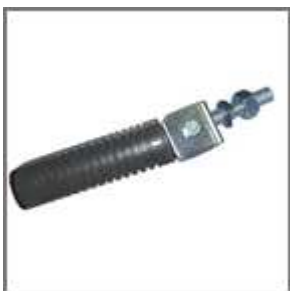
Ref. 0337RL Rieju