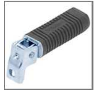
Ref. 0334 Invertido