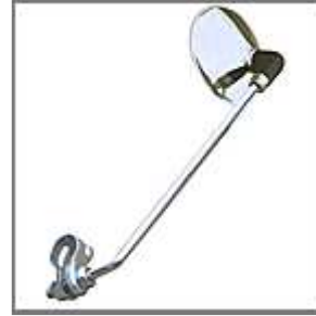
Ref. 1114 Ø 80mm