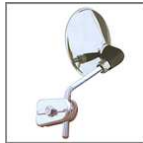
Ref. 0112 Ø 80mm