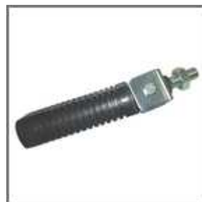
Ref. 0341 Bultaco