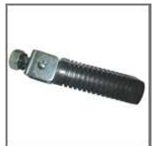
Ref. 0338 Sanglas