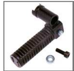
Ref. 0372 Derbi