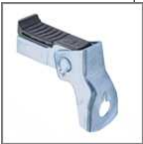
Ref. 0332 Corto