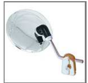
Ref. 0110 Ø 105mm