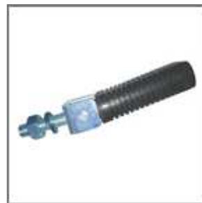
Ref. 0336.2 Montesa