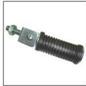
Ref. 0353 M10 Suzuki