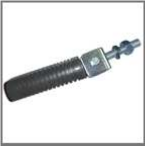
Ref. 0337 Universal