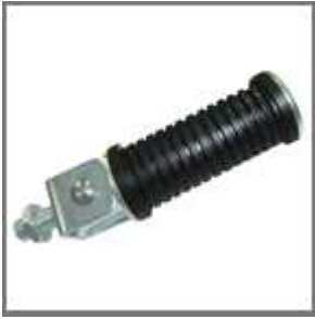
Ref. 0132 Ducati