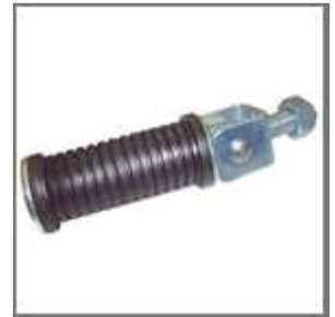
Ref. 0353M12 Yamaha