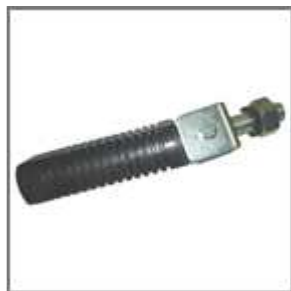
Ref. 0336.1 Ossa