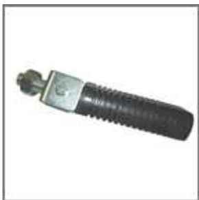
Ref. 0335 Ducati