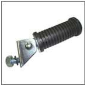
Ref. 0138 Montesa