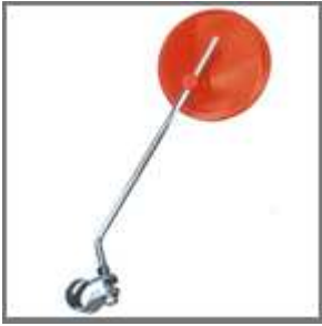
Ref. 0172 Ø 72mm