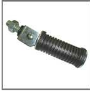
Ref. 0133 Ossa