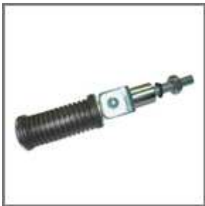
Ref. 0354 Rieju