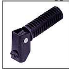
Ref. 0360 Honda