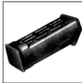
Ref. 0136 Recambio Derbi