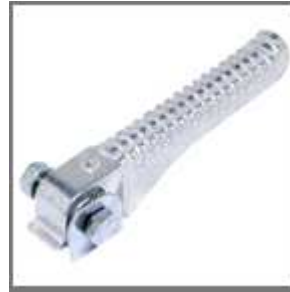
Ref. 0373 Piaggio