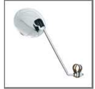
Ref. 1116 Ø 105mm