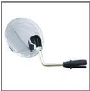
Ref. 1106 Ø 105mm