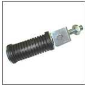
Ref. 0303 Hyosung