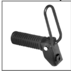
Ref. 0352 Honda