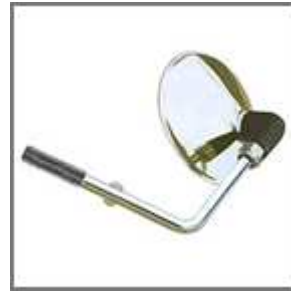
Ref. 0105 Ø 80mm