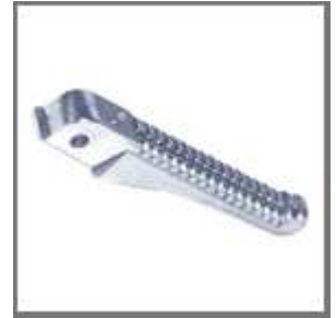
Ref. 0389 Universal