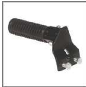
Ref. 0370 Katana