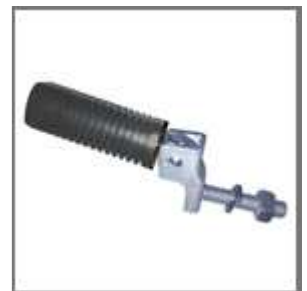
Ref. 0340 Ossa