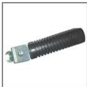
Ref. 0337RC Rieju