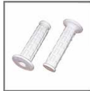
Ref. 1225 Vespino