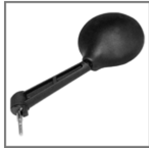
Ref. 1301 Vespino