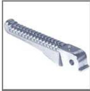
Ref. 0383 Rieju