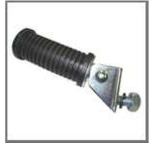
Ref. 0140 Derbi