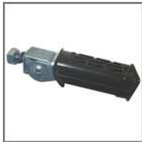
Ref. 0135 Derbi