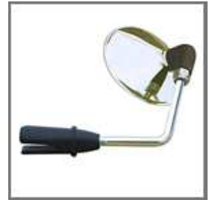
Ref. 1108 Ø 80mm