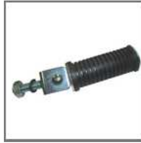
Ref. 0134 Universal